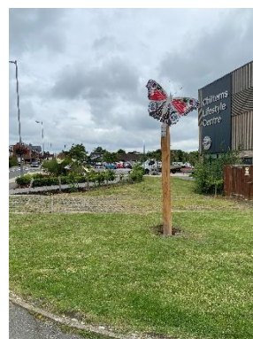
The smallest is the gatekeeper, the next is the marbled white and finally the peacock.