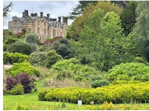
New Scotney Castle (1837)