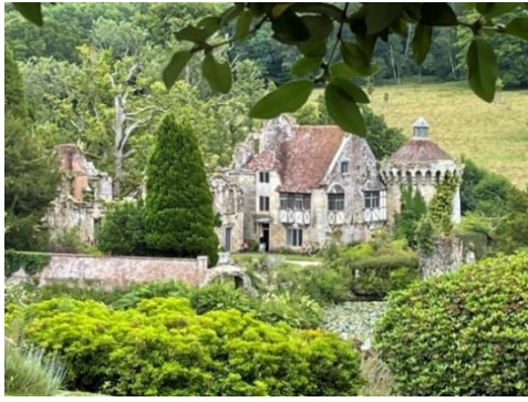
Old Scotney Castle (1378)