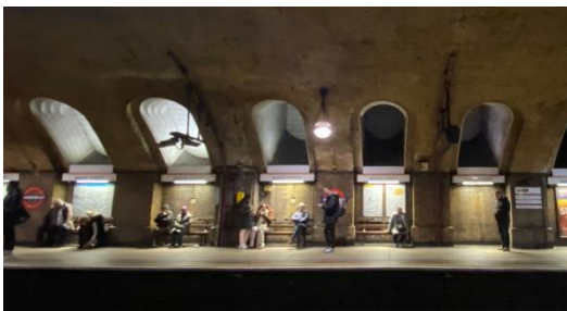
Baker Street Station - showing the vents that used to allow smoke and steam to escape.